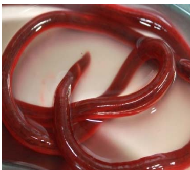
Figure 11 – Diocotphyne renale from the dog's kidney