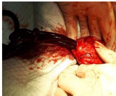
Figure 9 – Removing helminth from the kidney