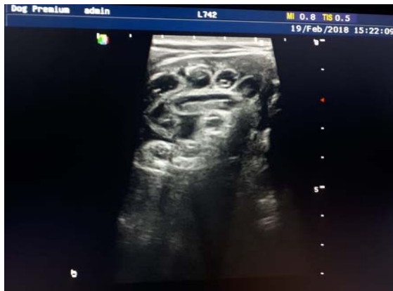
Figure 3 – Diocotphyne renale in the dog's kidney pelvis