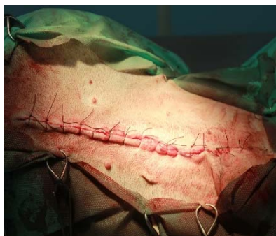
Figure 15 – Suture on the wall of the abdominal cavity after surgery