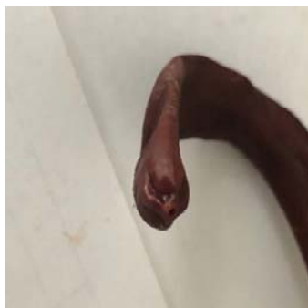
Figure 14 – Head end of Dioctophyme renale