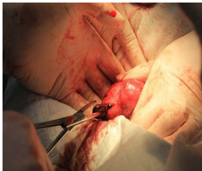
Figure 8 – Capturing helminth with forceps