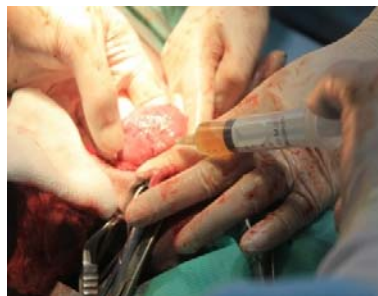
Figure 6 – Suction of fluid from the tissues around the kidney