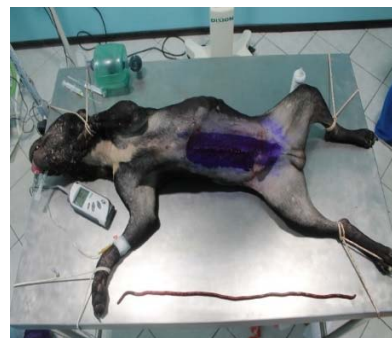
Figure 16 – Postoperative anesthesia in a dog

A small incision was made in the kidney wall, the forceps were carefully inserted into the incision, the helminth was fixed, and removed carefully through the incision using the twisting method (figures 5–9).