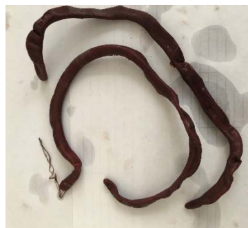
Figure 12 – Female and male of Diocotphyne renale