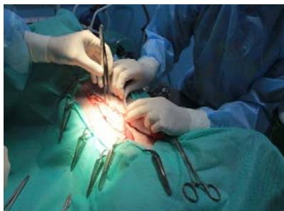
Figure 5 – Incision of the abdominal wall