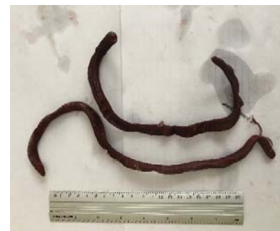
Figure 13 – Measurement of Diocotphyne renale