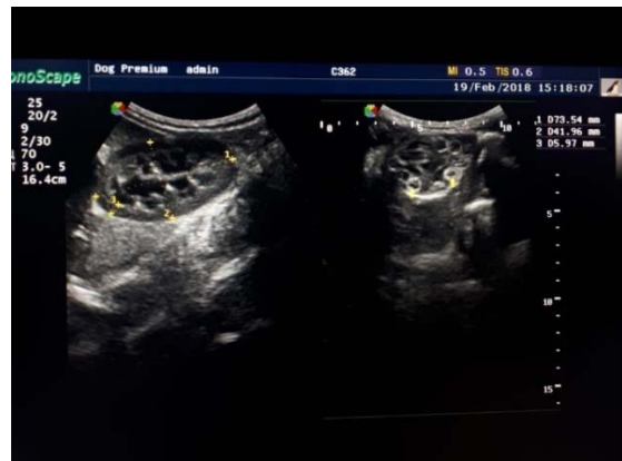
Figure 4 – Dog's kidneys ultrasound examination results