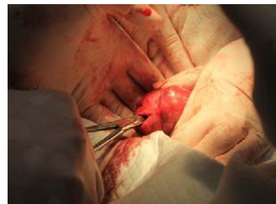
Figure 7 – Incision of the kidney wall