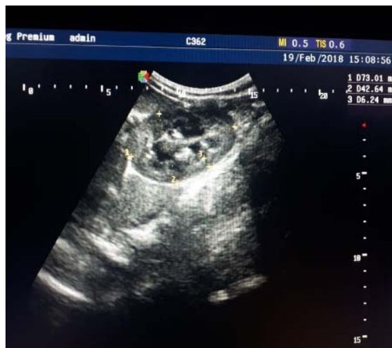
Figure 2 – Dog's kidney ultrasound Results