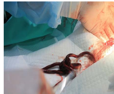
Figure 10 – Helminth extracted from the dog's kidney