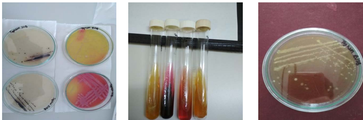
a) Salmonella Abortus Ovis and Proteus Vulgaris