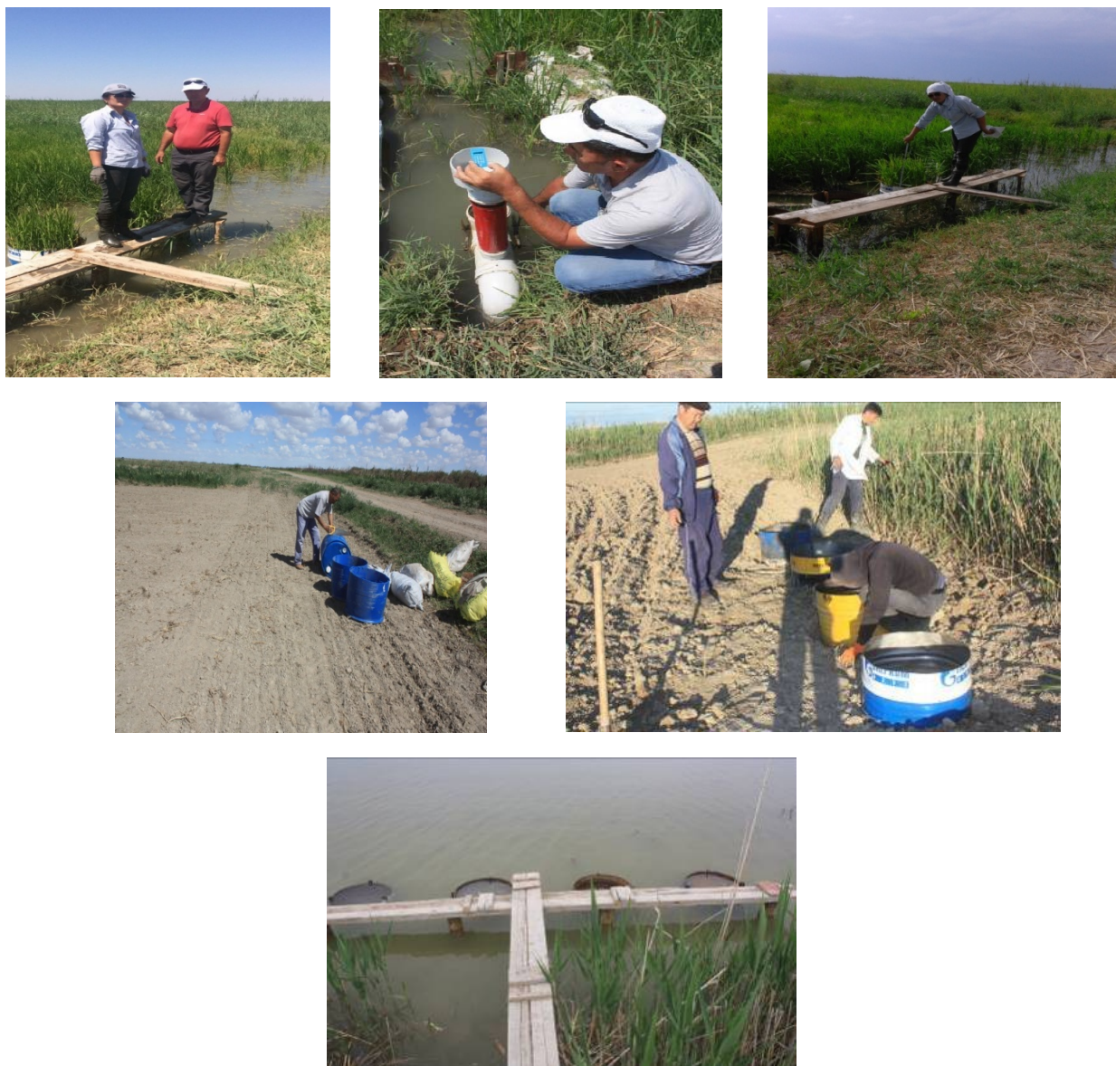
Figure 2 – Components of the irrigation norm of rice

The research of the actual costs of irrigation water was carried out by directly determining all the quantities included in the water balances of the field and checks, which were compiled on the basis of the Zaitsev equation [12]: