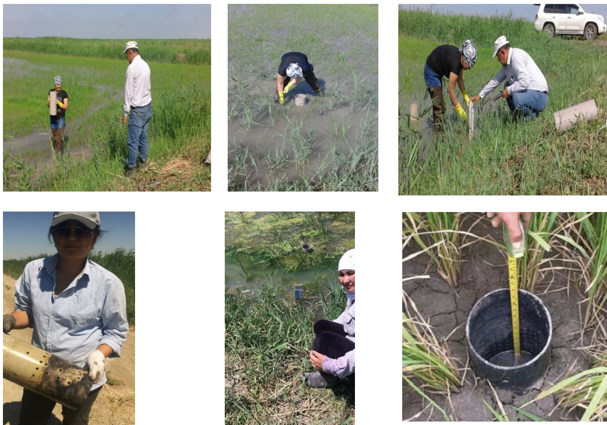
Figure 1 – Simple perforated pipe