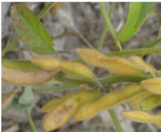
Figure 4 – Beans and soybean leaves damaged by Buffalo treehopper Stictocephalabisonia Kopp&Yonkeand infected with a viral disease

The discussion of the results. Total recorded of 10 species and 8 genera of leafhoppers, treehoppers and spittlebugs belonging from 3 families (Membracidae, Cicadellidae and Aphrophoridae) on the soybean fields in Almaty region. The greatest number of species belongs to the family Cicadellidae – 8 species, to Membracidae and Aphrophoridae belongs by one species. Genus Agallia and genus Macrosteles from the family of Cicadellidae are represented by 2 species each, all the rest of the genus from all families include one species. All the species found are polyphagous pests of agriculture, damaging a variety of grains, legumes, fodder, technical, fruit and berry and industrial crops. Of these the most