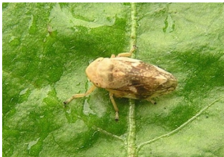
Figure 1 – Meadow froghopper Phyllaenus pumarius L. Family Cicadellidae Latreille, 1802 – Leafhoppers

Agalliavenosa (Fourcroy, 1785) – Venous leafhopper. The polyphage species, known as the pest of sunflower, is common in crops of alfalfa, clover and sugar beet. Carries a virus of curly leaves of tomato, potato, pepper, tobacco, beet, chicory, cereals. In the year 2 generations. Winter imago in the litter. In May, after supplementary feeding on young greens, females begin laying eggs. The summer generation is winged in late June - July, wintering - in August. Adults and especially larvae kept in the lower tier of plants and among plant remains in dry biotopes with low grass stand. Distribution: Europe, North Africa, Caucasus, Kazakhstan, Central Asia. On soybean in a single quantity.