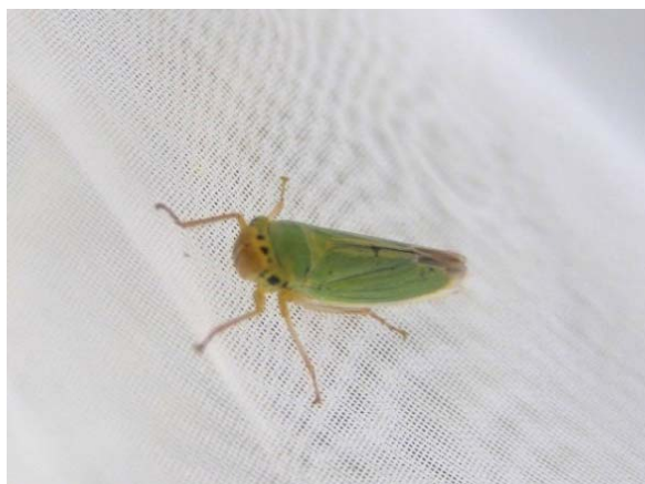
Figure 2 – Green leafhopper Cicadellaviridis (L.)

as well as clover, sainfoin, lupine etc.; from garden crops especially strongly harms table beet, early cabbage, cucumbers, carrots, tomatoes. Damaged crops characterized by thinness, poor bushiness, drying of the leaves from the top and the appearance of spotting at the injection sites. The carrier of the virus is the nightshades stolbur, the greening of the clover flowers, asters jaundice virus. It develops in 2 generations in the north, 5 in the south. Hibernates in the tissues of the root part of the stems and winter cereals. In late April, larvae are born, their development occurs on young leaves of cereals. Damaged plants become flaccid, the leaves become whitish-yellow or greenish-brown in color, dry out and curl along the main vein. Widely distributed in Europe and extra-tropical Asia species, brought to North America. On soybean in a single quantity.